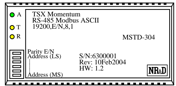
Figure 1 MSTD-304 Layout

The MSTD-304 is powered by the Momentum base. LED indicators show the state of POWER(A), Serial TX(T) and RX(R). The green A LED should be on if the MSTD-304 is properly powered by the base. The A light will flash slowly if the unit is set to slave address 0. The yellow T light is on while the MSTD-304 is transmitting data while the R light indicates data arriving at the MSTD-304.