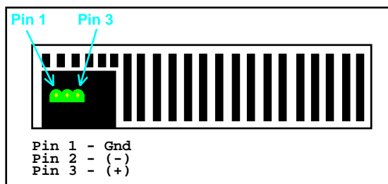
Figure 3 3-Pin RS-485 Port

The MSTD-009 has a 3-position screw terminal 4-wire connection. The pinout is shown in Figure 3.