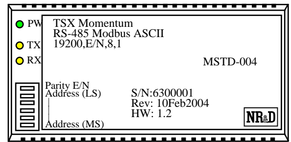
Figure 1 MSTD-004 Layout

The MSTD-004 is powered by the Momentum base. LED indicators show the state of POWER, Serial TX and RX. The green POWER LED should be on if the MSTD-004 is properly powered by the base. The POWER light will flash slowly if the unit is set to slave address 0. The yellow TX light is on while the MSTD-004 is transmitting data while the RX light indicates data arriving at the MSTD-004.